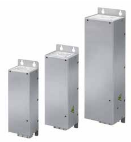
Frame sizes Three different frame sizes of line filters correspond to the M1, M2 and M3 enclosures of the VLT® Micro Drive